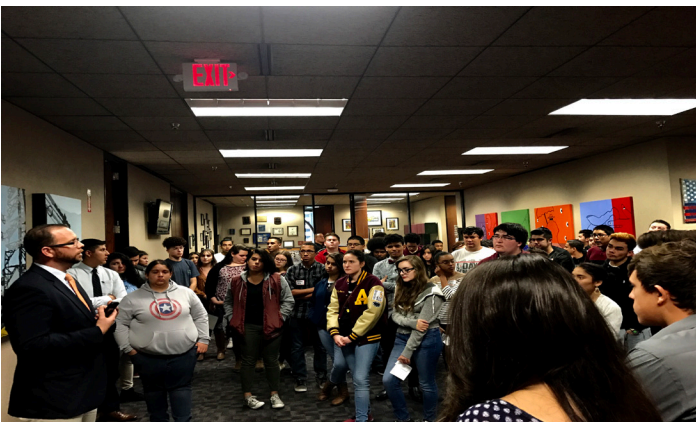
Commissioner Stout speaking to Andress High School students at El Paso County