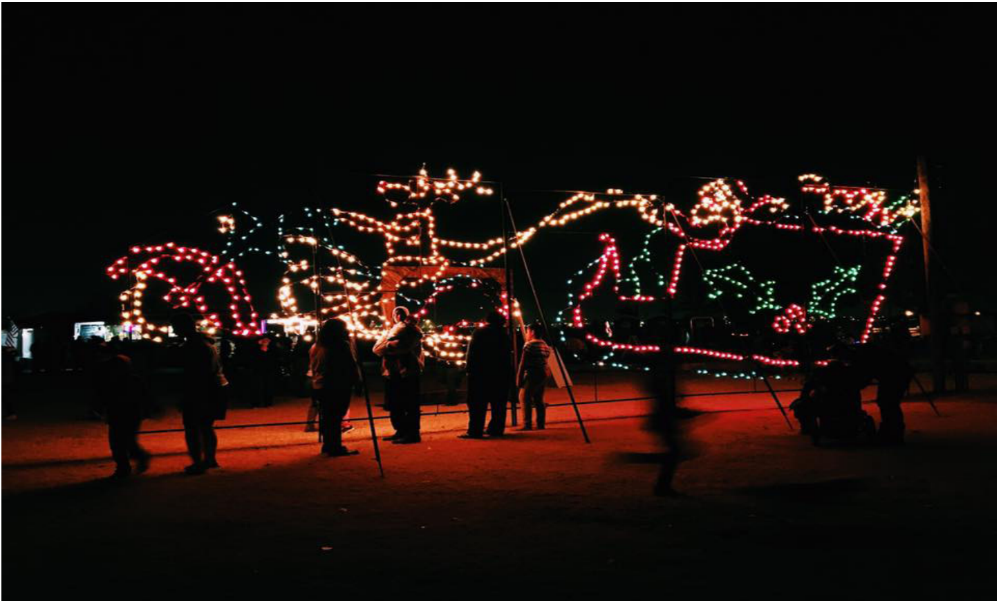
Ascarate Park's Annual Lights on the Lake