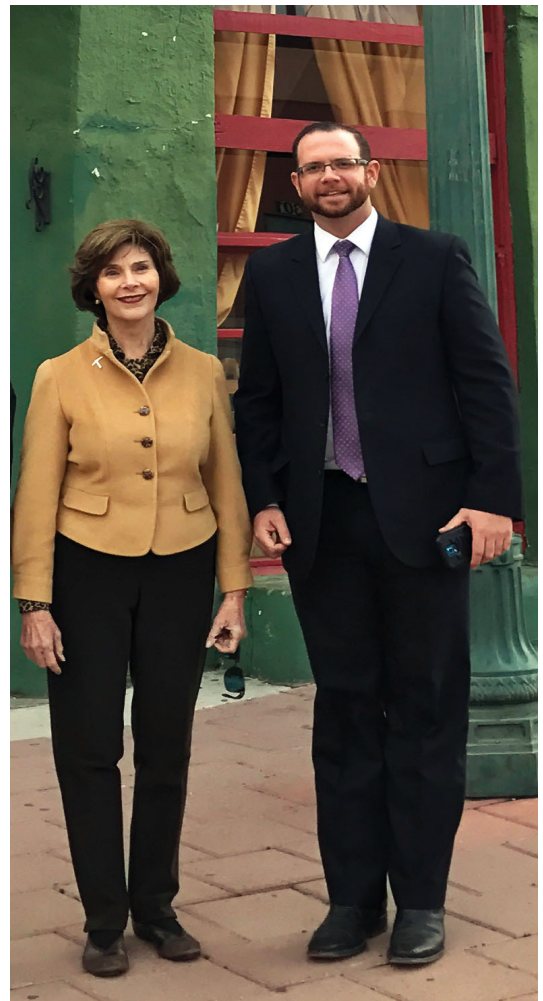
Commissioner Stout and Former First Lady Laura Bush in Downtown El Paso.