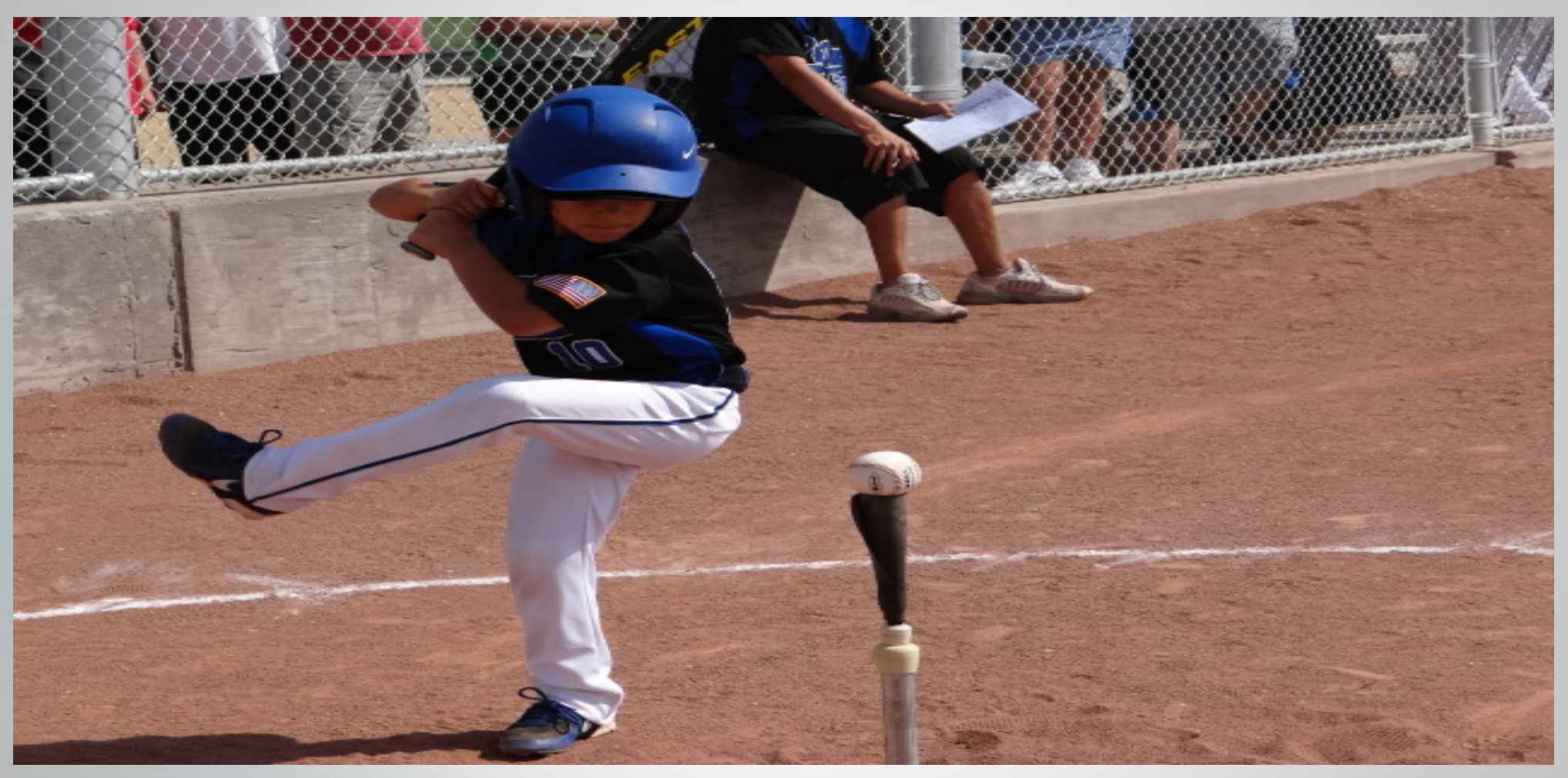
Leagues, starting with the T-Ball Leagues, are already playing at the Sportspark year round.