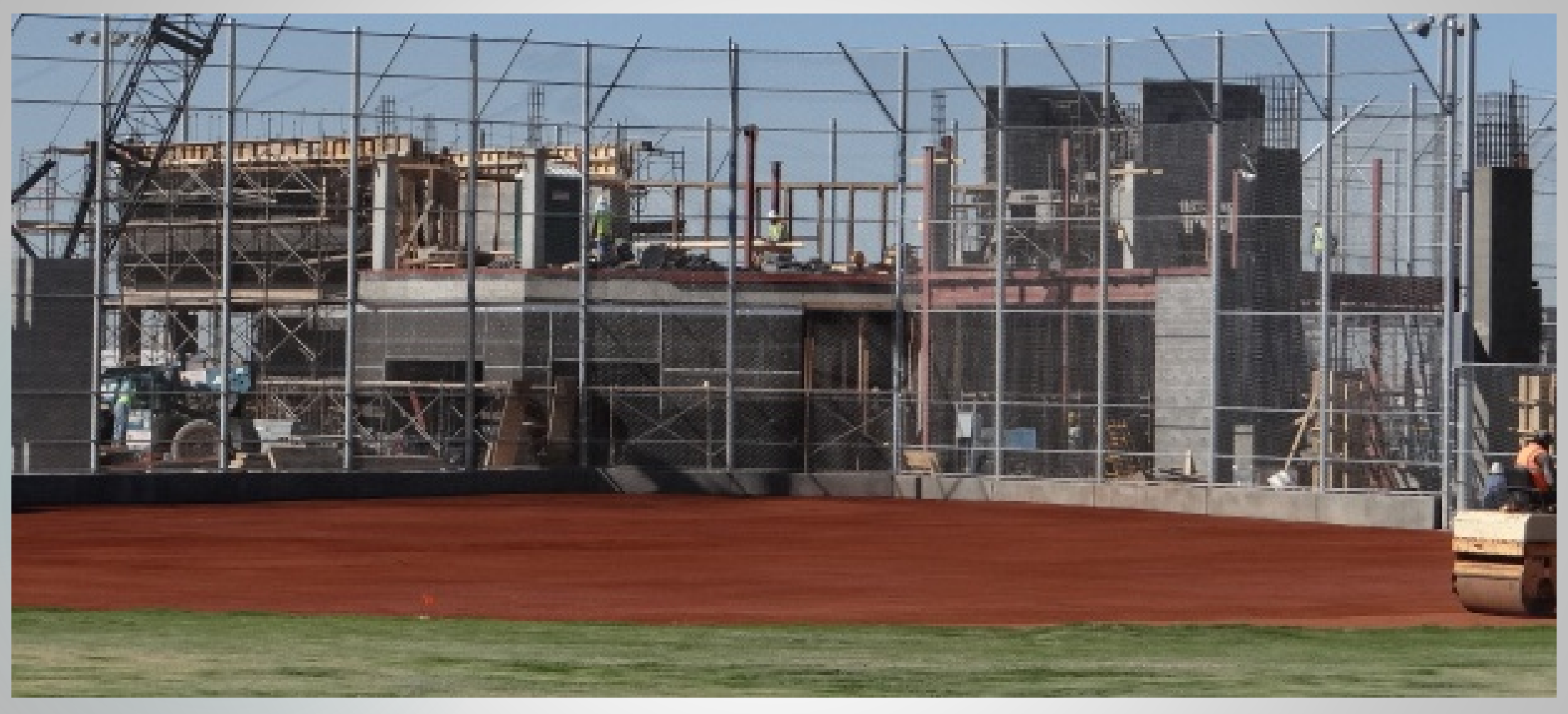
Our new two story Clubhouse is well on its way to completion.