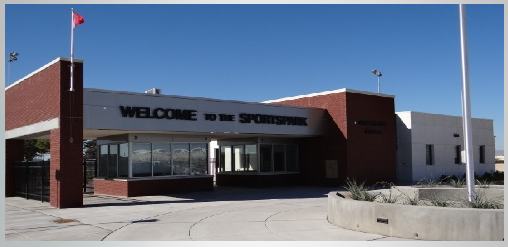
Patrons will pay their admission fee at the state of the art administration building.