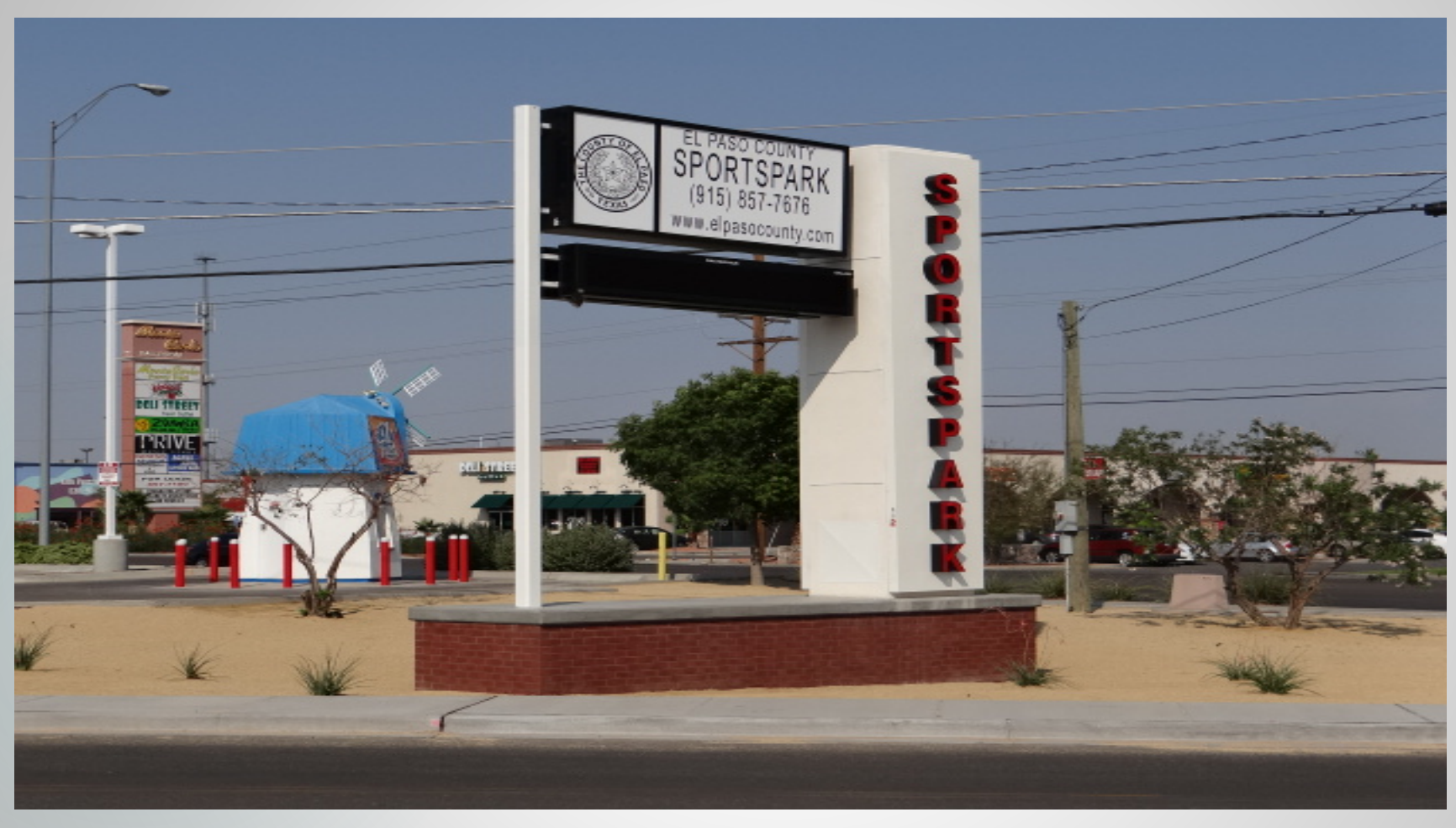
Motorists on Zaragosa will be directed to the Sportspark by our new street sign.