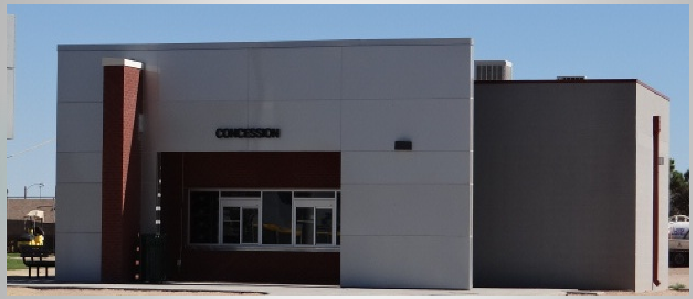
Located centrally to all of the fields, the concession stand will provide food and beverages to players and families.