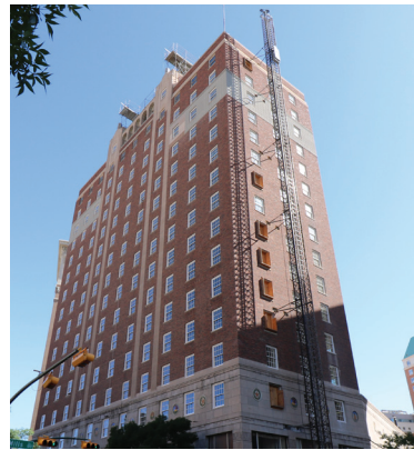
(pictured left) Plaza Hotel Pioneer Park building during renovations

The Plaza Hotel Pioneer Park is utilizing El Paso County’s TX-PACE program to finance $9.2 million of energy efficiency improvements. The project measures include renovations to HVAC, elevator, lighting, windows, and plumbing systems. This is the second TX-PACE project in El Paso County and the largest TX-PACE border project.