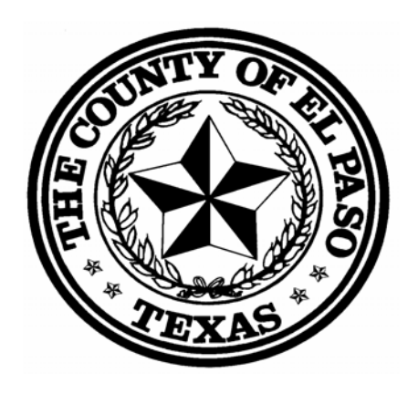
Exhibit F is AVAILABLE HARD COPY