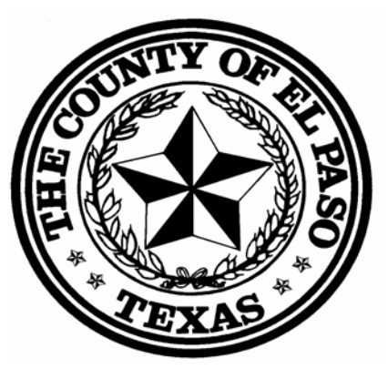
Exhibit G is AVAILABLE OR HARD COPY