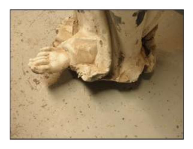
Figure 6A. Area of missing left foot