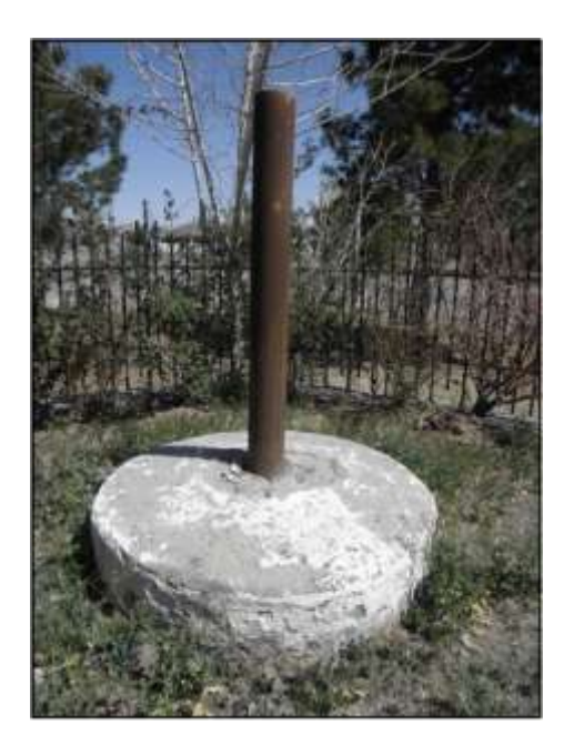
Figure 15A. Steel pipe from display in Ascarate Park.