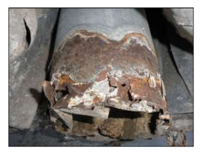
Figure 11A. Corroded end of the galvanized steel tube.