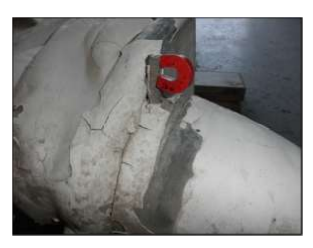
Figure 5A. Iron armature protruding from behind left shoulder