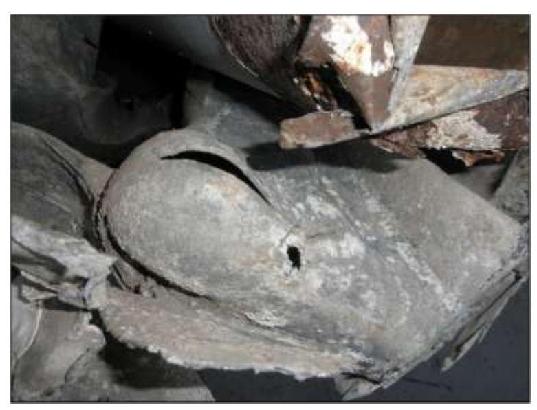
Figure 8A. Damaged to the internal portion heel of the right foot.