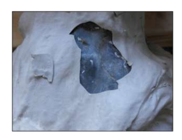
Figure 14A. Coating failure 1