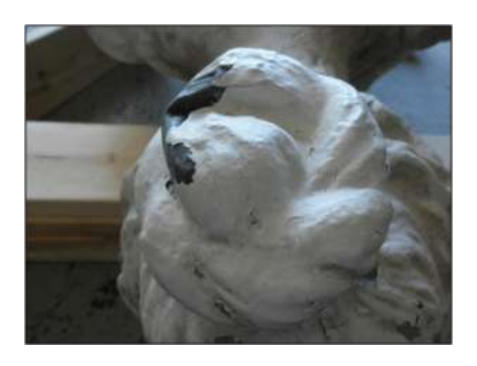
Figure 13A. Deformation to the zinc shin on the back of the head.