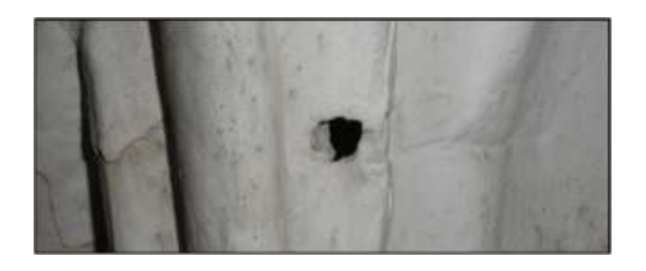
Figure 12A. Hole located in the front mid section of the sculpture.