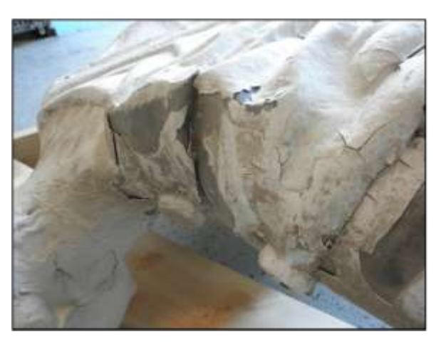
Figure 4A. Detail of damaged left shoulder.