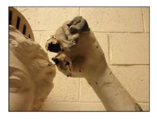
Figure 1A. Damaged section of the figure's left hand. shoulder