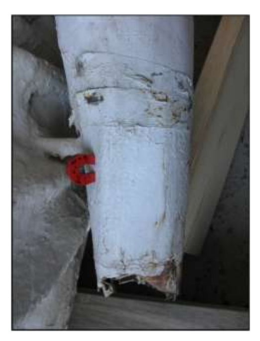
Figure 9A. Lower portion of the right arm with an improper steel sheet metal repair.