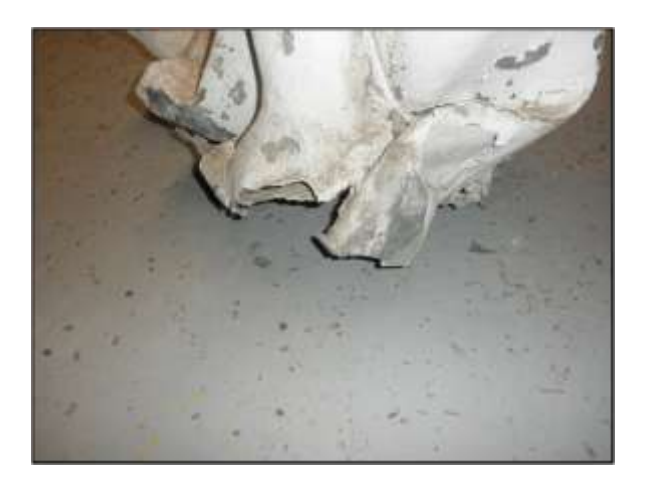
Figure 7A. Damaged missing area of drapery