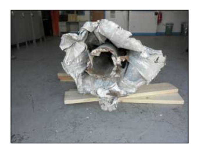
Figure 10A. Bottom of the sculpture showing the internal galvanized steel tube.