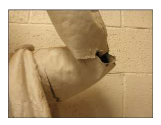
Figure 3A. Damaged left elbow and