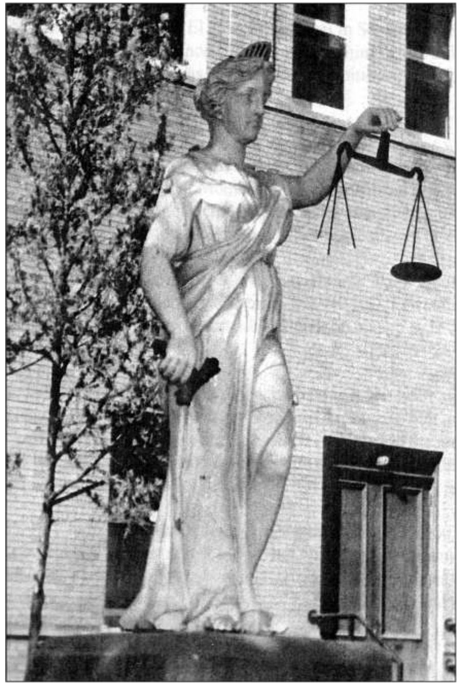
Figure 1-B. Historic image of the sculpture in nearby park near Liberty Hall