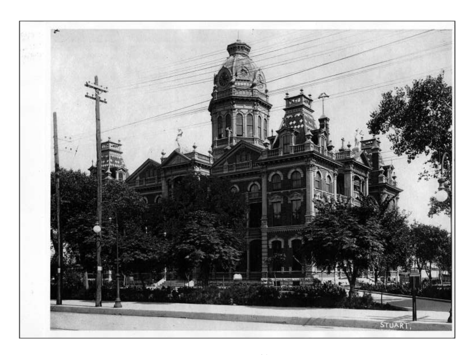
Figure 2-B. Historic image of the 1886 El Paso Courthouse. Lady Justice is located on the roof at the main entrance.