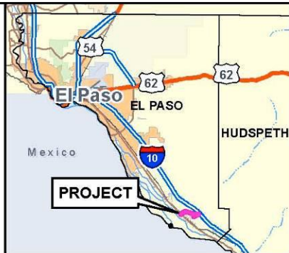
FIGURE 1 PROJECT LOCATION

PROPOSED FM 3380 (MANUEL F. AGUILERA HIGHWAY)