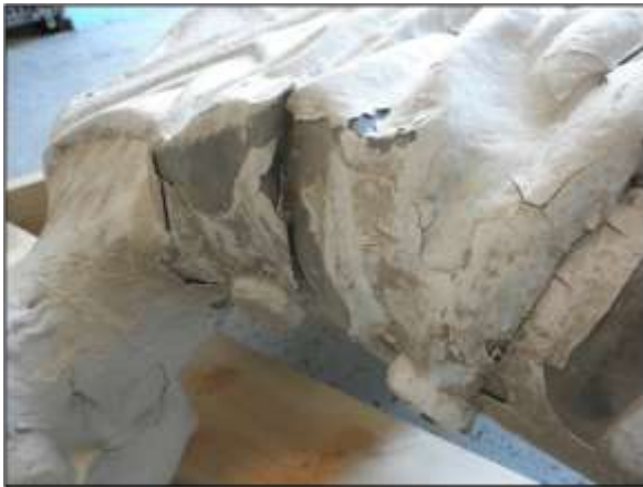
Figure 4A. Detail of damaged left shoulder.