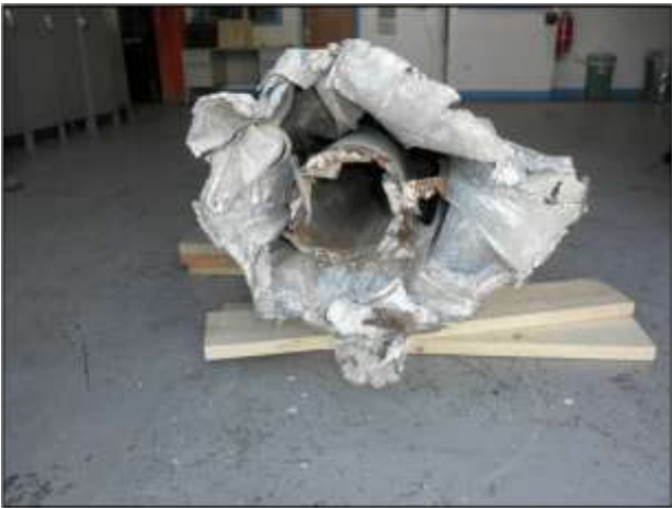
Figure 10A. Bottom of the sculpture showing the internal galvanized steel tube.