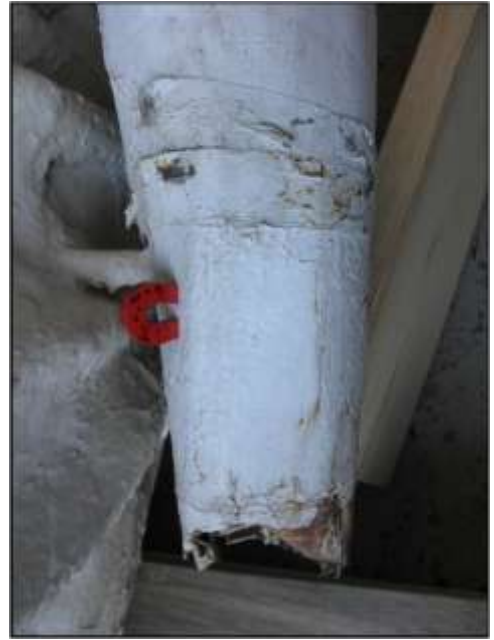
Figure 9A. Lower portion of the right arm with an improper steel sheet metal repair.