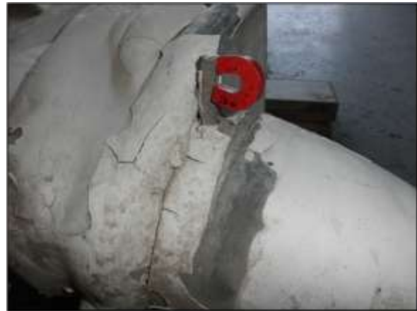
Figure 5A. Iron armature protruding from behind left shoulder