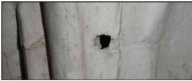
Figure 12A. Hole located in the front mid section of the sculpture.