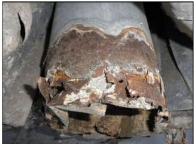
Figure 11A. Corroded end of the galvanized steel tube.