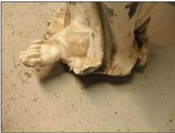
Figure 6A. Area of missing left foot