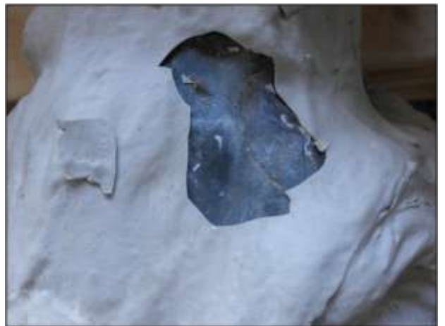
Figure 14A. Coating failure 1