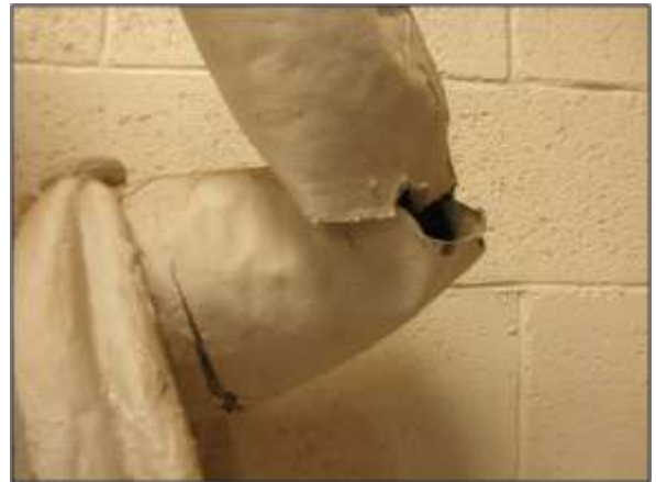
Figure 3A. Damaged left elbow and shoulder