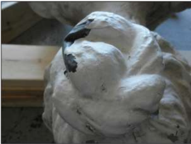
Figure 13A. Deformation to the zinc shin on the back of the head.