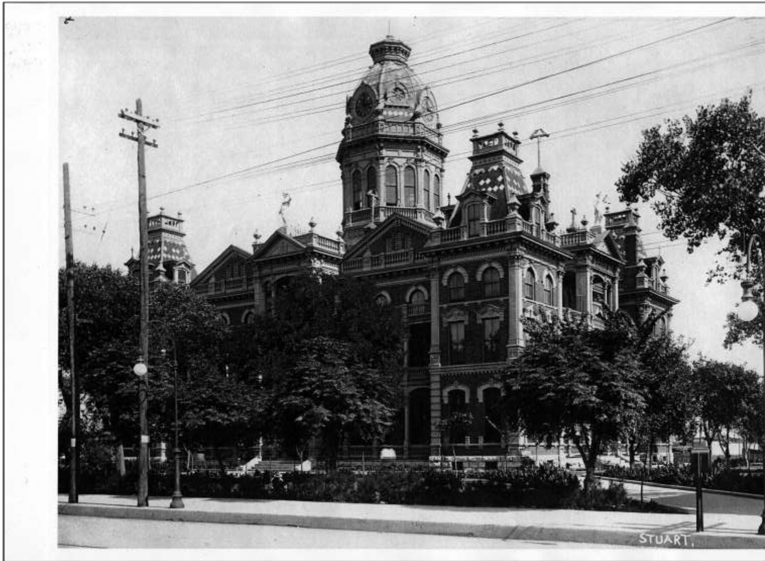
Figure 2-B. Historic image of the 1886 El Paso Courthouse. Lady Justice is located on the roof at the main entrance.