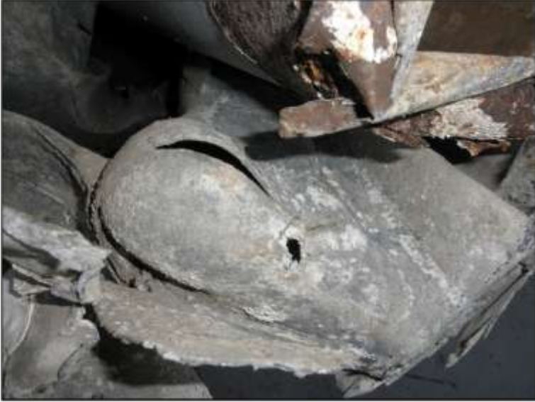
Figure 8A. Damaged to the internal portion heel of the right foot.