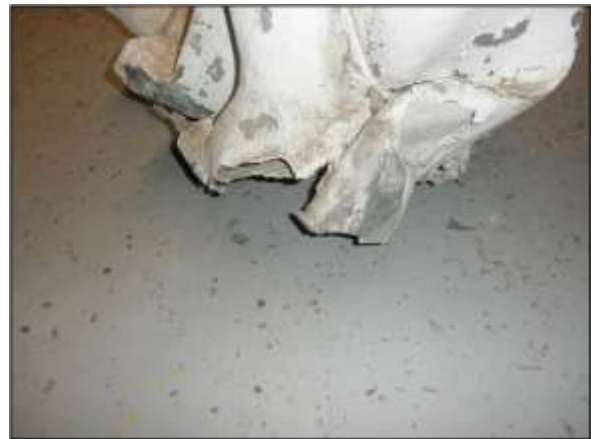
Figure 7A. Damaged missing area of drapery