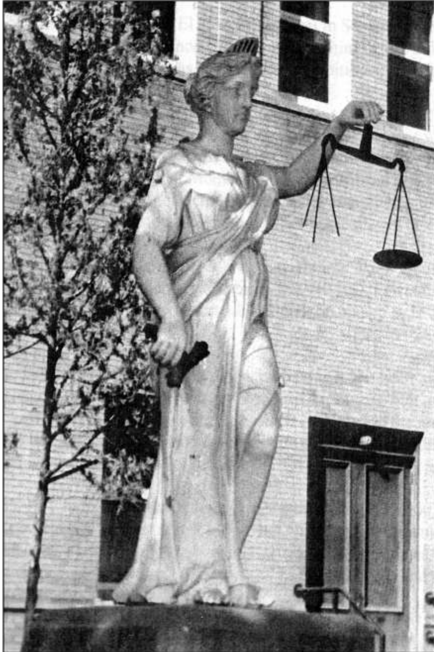
Figure 1-B. Historic image of the sculpture in nearby park near Liberty Hall