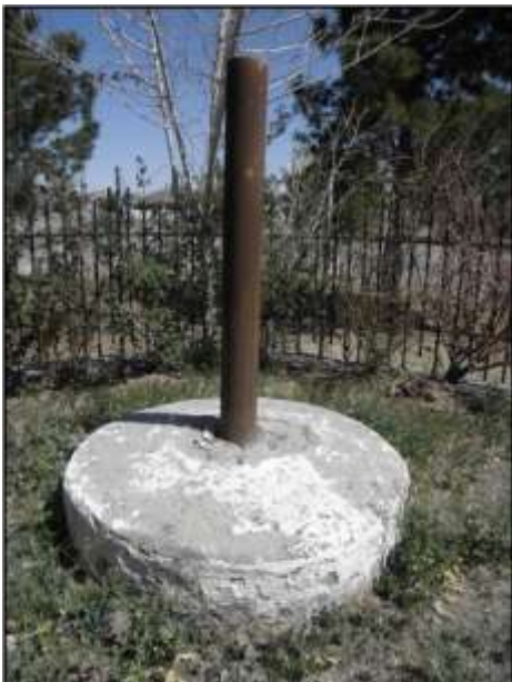
Figure 15A. Steel pipe from display in Ascarate Park.