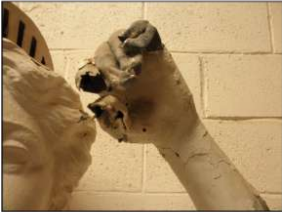
Figure 1A. Damaged section of the figure's left hand. shoulder